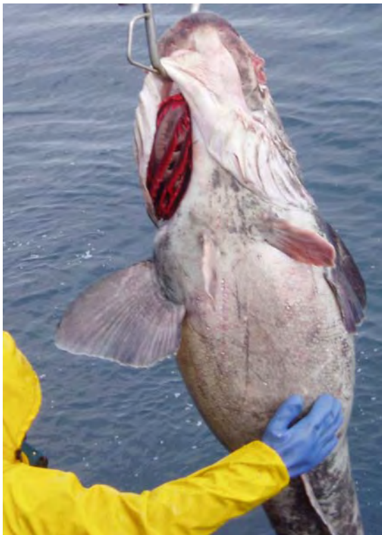
Antarctic Toothfish Dissostichus mawsoni