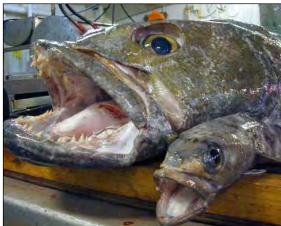
Patagonian Toothfish Dissostichus eleginoides